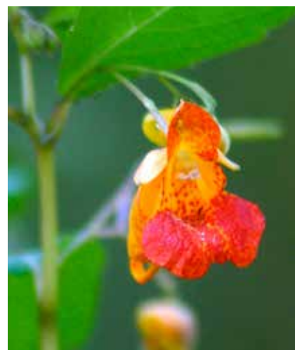
Jewelweed ( Impatiens capensis )

The standard recipe for hummingbird feeders mimics the preferred range of nectar solution found in favorite hummingbird flowers (between 20 and 30 percent). This sugar-water solution is made of 1 cup white cane sugar dissolved in 4 cups of water. Use room temperature water and stir well. Heating or boiling the water is not necessary. Using red dye might attract the birds but