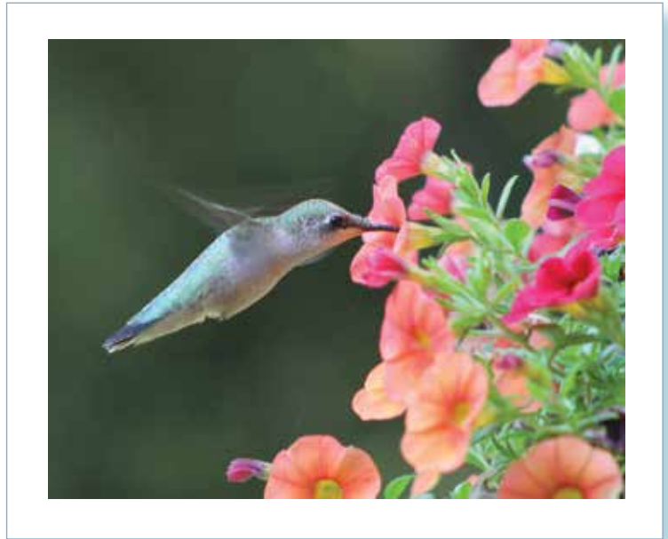
Female ruby-throat feeding from 'Million Bells' ( Calibrachoa )

Don't worry if you don't see hummingbirds during the month of May. Adult female hummingbirds are busy catching protein-rich insects and may visit feeders less frequently while nesting and feeding nestlings. Unless a hummingbird is maintaining a nesting or feeding territory near your yard, you may not see any hummingbirds during nesting season. You can expect feeder and flower visits to increase after nestlings leave the nest. Nonetheless, keeping your feeder stocked can provide necessary calories during this time.