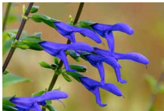
Anise sage ( Salvia guaranitica )